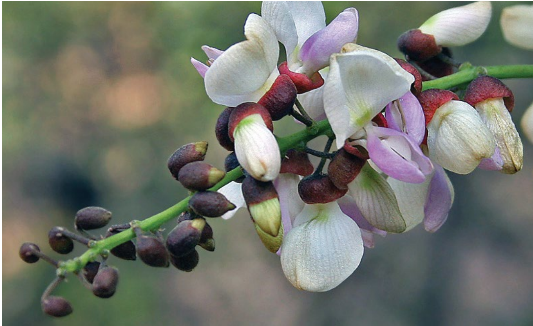
Figure 2. Close-up of Millettia pinnata inflorescence, Shamirpet, Andhra Pradesh, India (Source: Pongamia_pinnata_(Karanj)_near_Hyderabad_W_IMG_7631.jpg ; Author: JM Garg (2009), licensed under a GNU Free Documentation License, Version 1.2).

Pods are smooth, flattened but slightly swollen, oblique-oblong to ellipsoid (3–8 cm x 2–3.5 cm x 1–1.5 cm), slightly curved with a short, curved point (beaked). They are 1–2 seeded, brown, thick-walled and leathery to sub-woody, hard and indehiscent; borne on short stalks in quantities. Seeds are elliptical or compressed ovoid, bean-like, with a brittle coat (1.5–2.5 cm x 1.2–2 cm x 0.8 cm), flattened, dark brown and oily. It has an extensive lateral root system and a long taproot. Pongamia does not appear to require specific inoculation with Rhizobium bacteria (Daniel 1997; Orwa et al. 2009).