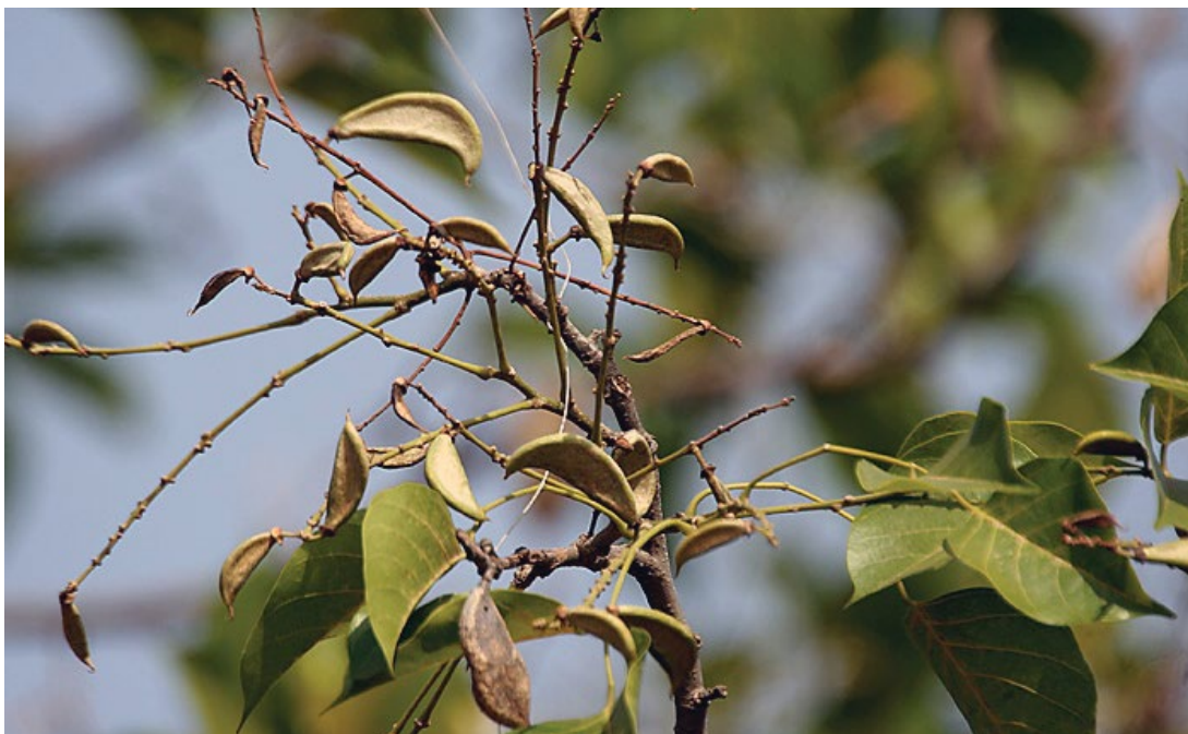
Figure 3. Millettia pinnata seed pods (Source: Pongamia_pinnata Seeds.jpg; Licensed under a Creative Commons Attribution 3.0 License).

Pods are smooth, flattened but slightly swollen, oblique-oblong to ellipsoid (3–8 cm x 2–3.5 cm x 1–1.5 cm), slightly curved with a short, curved point (beaked). They are 1–2 seeded, brown, thick-walled and leathery to sub-woody, hard and indehiscent; borne on short stalks in quantities. Seeds are elliptical or compressed ovoid, bean-like, with a brittle coat (1.5–2.5 cm x 1.2–2 cm x 0.8 cm), flattened, dark brown and oily. It has an extensive lateral root system and a long taproot. Pongamia does not appear to require specific inoculation with Rhizobium bacteria (Daniel 1997; Orwa et al. 2009).