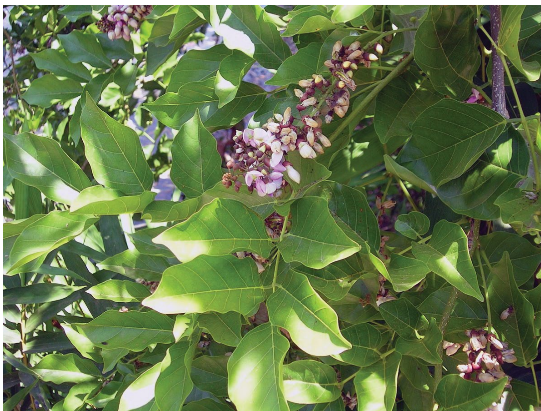
Figure 1. A flowering shoot of Millettia pinnata (Source: Derrispinnata.jpeg; Author: L. Shyamal (2007), licensed under a GNU Free Documentation License, Version 1.2).

The branchlets are hairless with pale stipule scars evident. The leaves are arranged alternately along the stems. Each leaf is composed of 5–9 leaflets with the terminal leaflet being largest. The leaves are hairless, pinkish-red when young, darkening to a glossy green above and a dull green with prominent veins below as they mature. The leaflets are ovate elliptical or oblong (5–25 cm x 2.5–15 cm), obtuse-acuminate at the apex, rounded to cuneate at the base, not toothed at the edges and slightly thickened. Stipules are caducous.