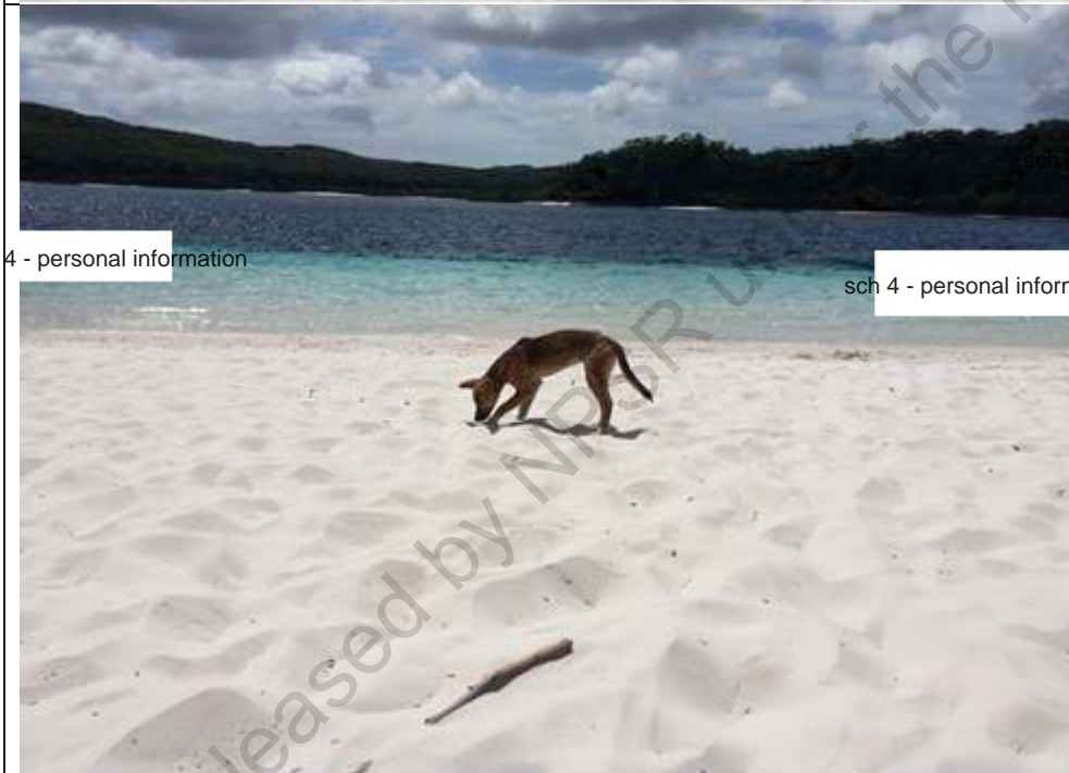
Photo 2. Description (who took photo/when): - personal information - personal information - personal information at time of interaction

Photo 1. Description (who took photo/when): - personal information - personal information - personal information at time of interaction