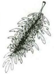
Floral Emblem Grevillea Robusta Silky Oak