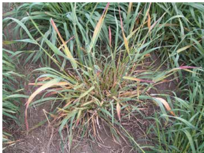
Figure 8: Barley yellow dwarf virus on oats

Insecticidal seed dressings can be used to control aphids in the seedling stage and reduce BYDV infection. Control of alternate aphid hosts and good crop nutrition will prevent infection and reduce yield loss.