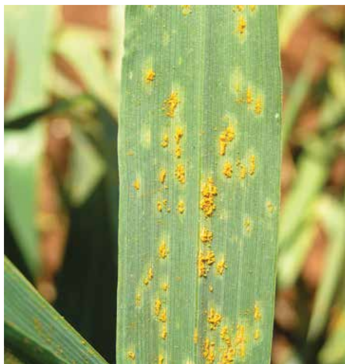
Figure 3: Leaf rust on oats

The symptoms are small, light orange-yellow pustules, appearing about 7–10 days after infection (Figure 3). Leaf rust mostly occurs on leaves and leaf sheaths, but also occurs on stems. It is seen first on the lower leaves and then spreads to the upper canopy.