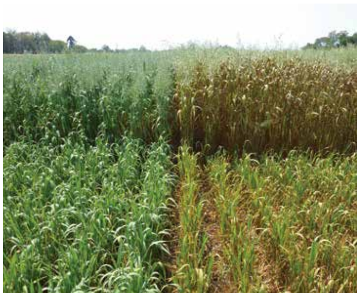
Figure 4: Leaf rust-resistant variety (left) alongside leaf rust-susceptible variety (right)

Resistant varieties are available, but new varieties are often overcome by new pathotypes or races of leaf rust. Many different races of leaf rust are present in Australia, and each race will often occur on only one variety.