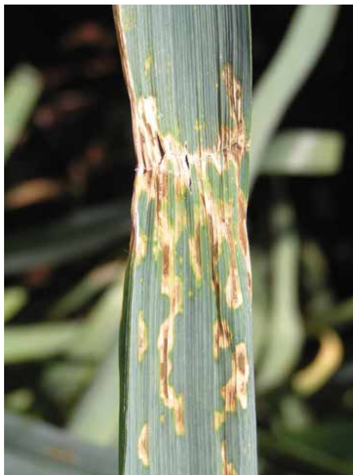
Figure 6: Bacterial blight on oats

The disease spreads by raindrop splash or mechanical means, and survives on seed and plant stubble. Bacterial blight is controlled by grazing to remove infected plant tissue (seed treatment is not effective).