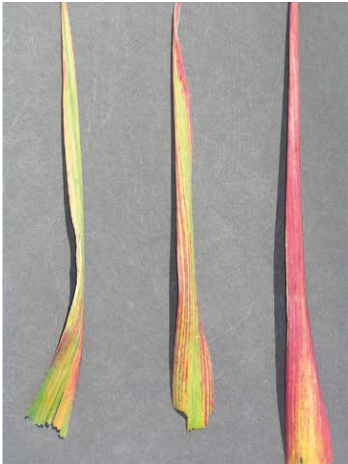
Figure 1: Red-tipping in oats

Red-tipping can be avoided by practising good crop nutrition. In paddocks with a history of this problem, increase nitrogen rates to 70–80 kg of nitrogen per hectare and check whether other nutrients are adequate. Top-dressing can be used to correct the problem, but good rainfall after application is necessary and, as a consequence, results can be erratic.