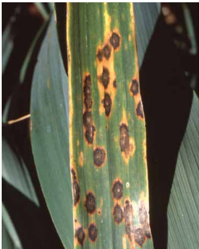
Figure 7: Septoria blotch on oats

The disease appears in autumn and spreads rapidly in cool, rainy weather. The disease spreads by raindrop splash or mechanical means, and survives on plant stubble. It rarely causes yield loss, but will reduce visual quality of hay.