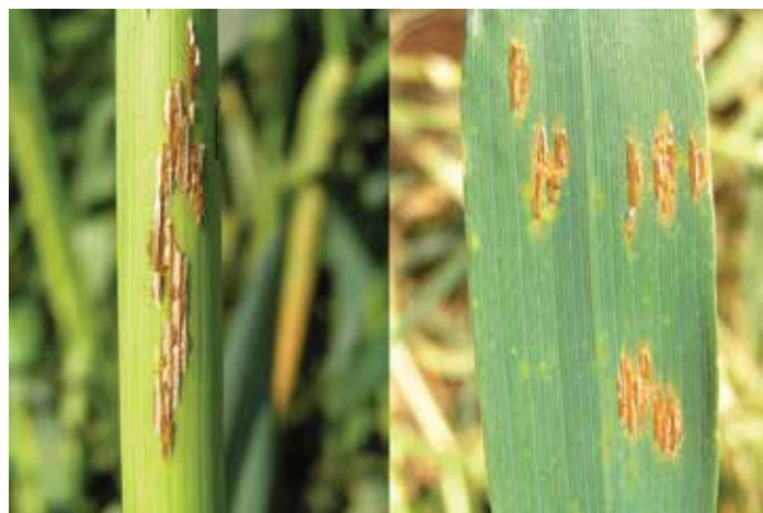
Figure 5: Stem rust on oat stems (left) and oat leaves (right)

No resistant varieties are available—all varieties in Australia are susceptible. As with leaf rust, many different races of stem rust are present in Australia.