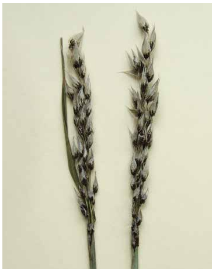
Figure 9: Loose smut on oats

Any seed that may be used for seed crops should be treated with a suitable fungicide before planting. Check to see if seed has been treated. If not, dress with Vitavax, Vitaflo or another registered seed treatment. Check the chemical label for details.