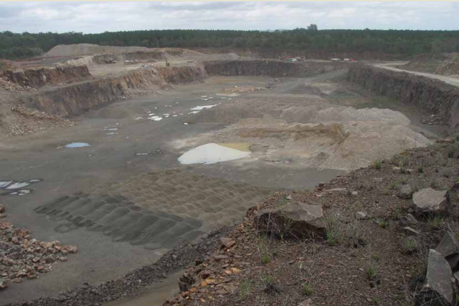
Sunrock Hard Rock Quarry, Beerburrum

In keeping with the AFS/PEFC certification of our own forest management system, Forest Products uses only paper products sourced from forests that have been certified as responsibly managed.