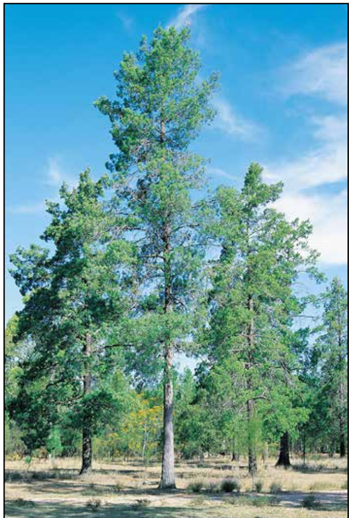
Native cypress forest