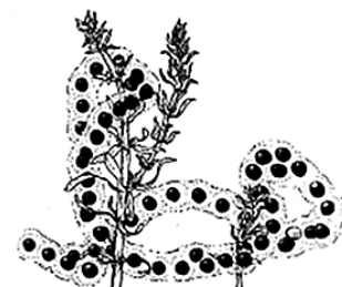
Figure 2. Drawing of toad spawn from Wildlife of greater Brisbane

Compared with native species, cane toad egg production is dynamic and a single clutch can contain up to 35 000 eggs. Remove any cane toad eggs found in the water and allow to dry out.