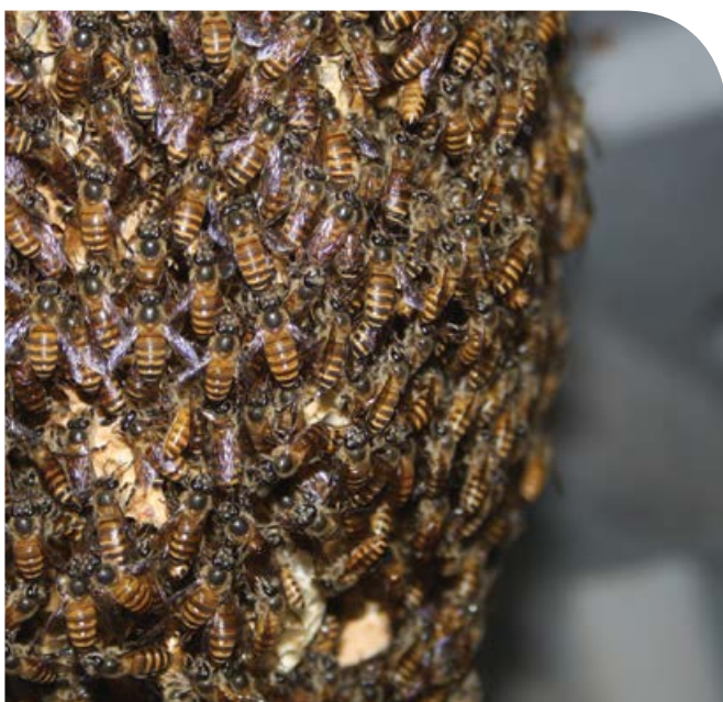
An Asian honey bee nest

If you see a swarm or nest of Asian honey bees or any other suspect bees near a port or boat marina anywhere in Queensland, and you suspect they are a new incursion, notify Biosecurity Queensland by calling 13 25 23 or by using our online reporting tool at www.biosecurity.qld.gov.au .