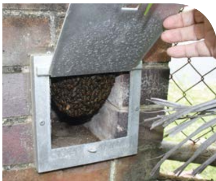
An Asian honey bee nest in a letterbox