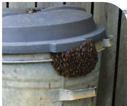
A swarm of Asian honey bees on a rubbish bin