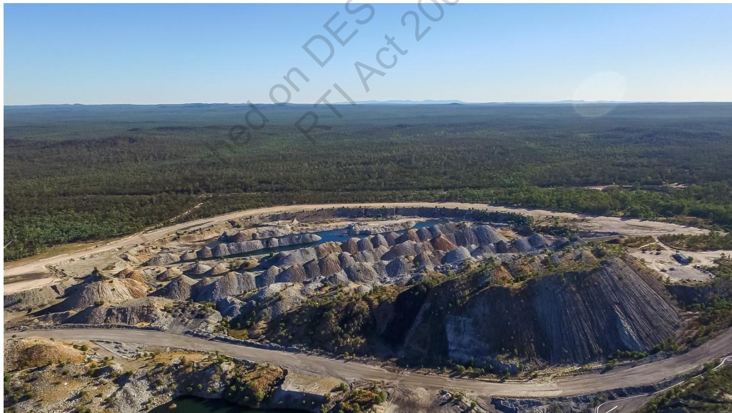
An aerial view of Blair Athol mine.

The Daily Mercury contacted TerraCom for comment, but did not receive a response by deadline.