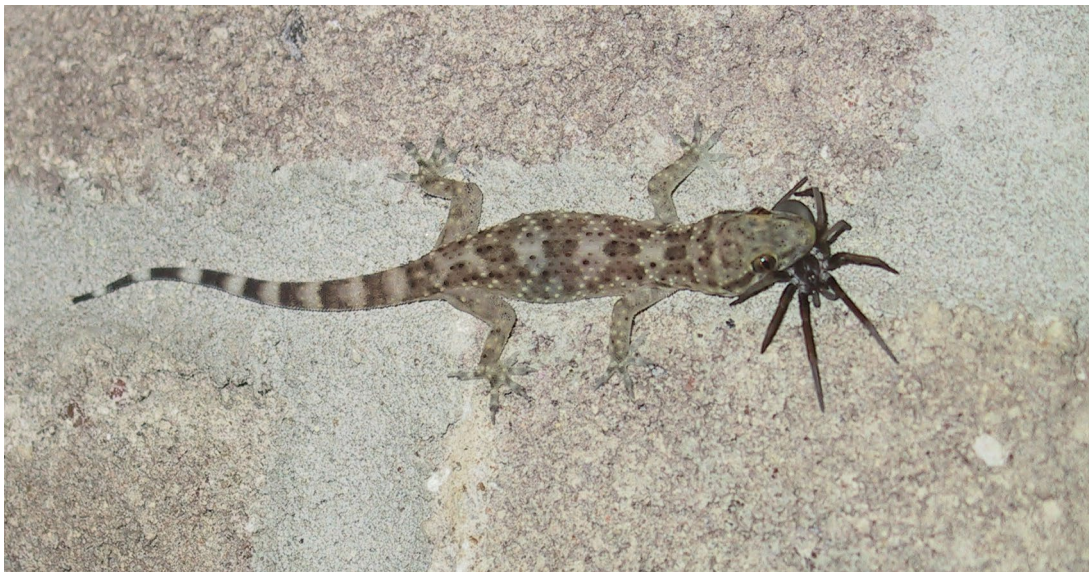
Figure 1. Hemidactylus frenatus eating a spider.