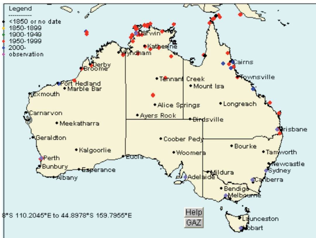
Figure 2. Distribution of Hemidactylus frenatus as represented by 213 specimen records in museum collections.

A population has also established on the main island of Norfolk Island (Cogger et al. 2005).