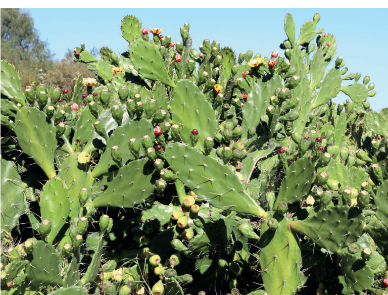
Drooping tree pear (Opuntia monacantha)

There are many low maintenance and attractive cacti that can be a great addition to the garden. However, growing, keeping and selling some cacti is illegal and penalties may apply. Be sure to check before you plant, sell or buy any cactus.