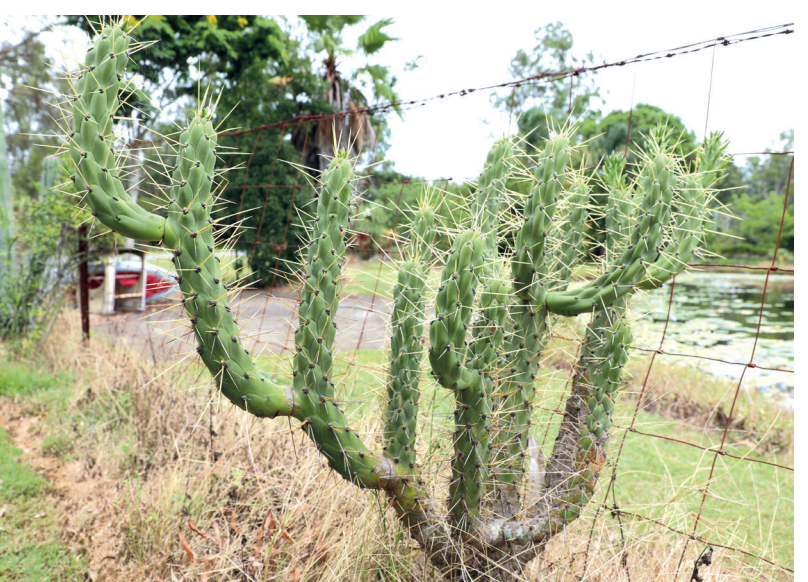
Eve's pin cactus (Austrocylindropuntia subulata)