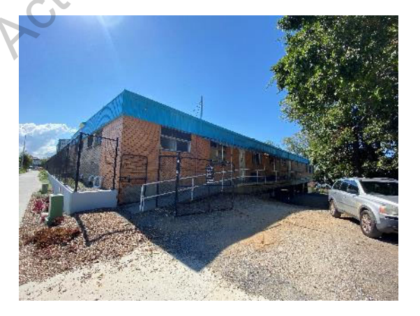
Figure 8. South Eastern corner of building showing ramp access to rear of building.