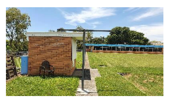
Figure 11 . Western side of smaller associated outbuilding.