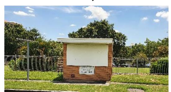
Figure 9. Southern side of smaller associated outbuilding.