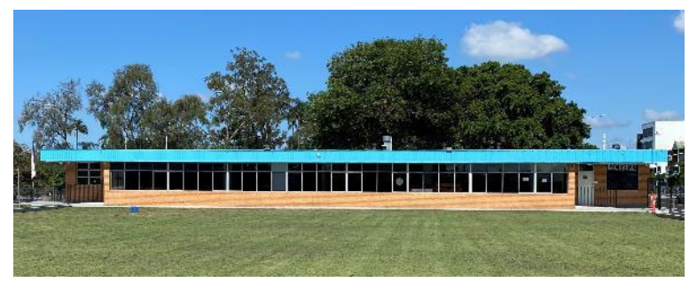
Figure 2 . Western elevation of former East Brisbane Bowling Club building fronting the bowling green – the front of the building.