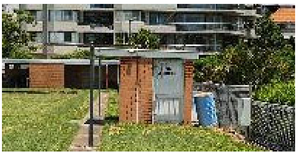
Figure 10. Eastern side of smaller associated outbuilding.