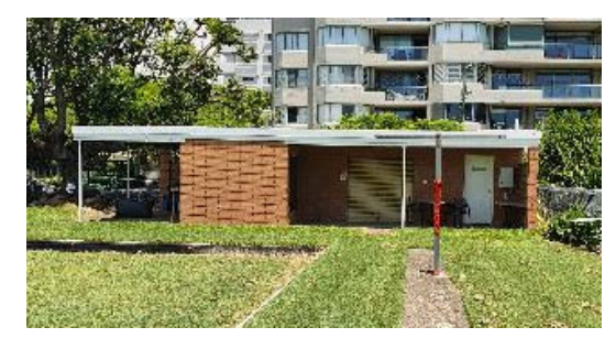
Figure 12 . Eastern side of larger associated outbuilding.