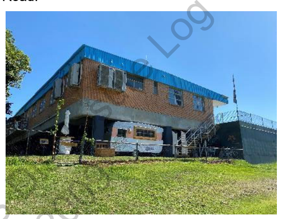
Figure 6. Northern side of building.