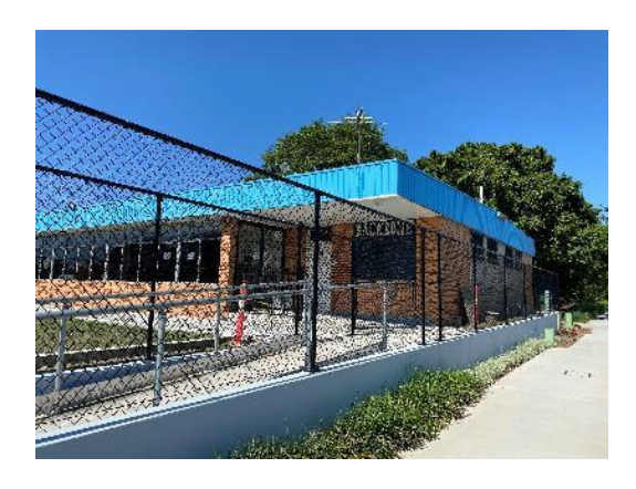
Figure 4. South Western corner near Lytton Road.