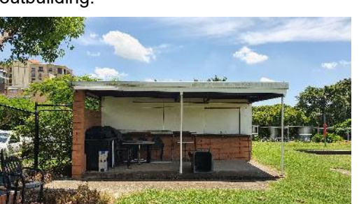
Figure 13 . Southern side of larger associated outbuilding.