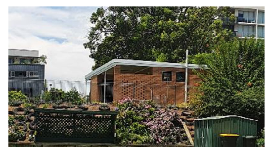
Figure 14 . Northern side of larger associated outbuilding.