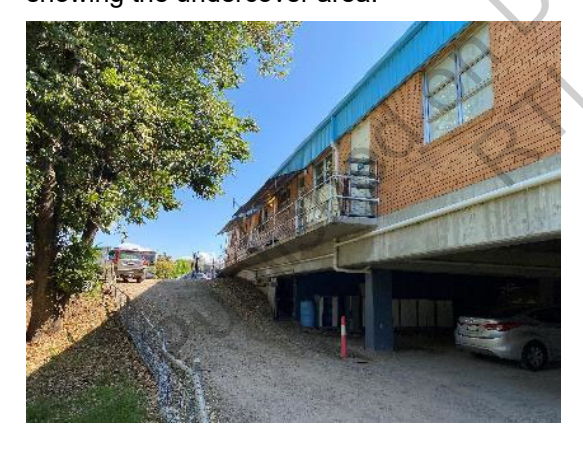
Figure 7. Rear of building showing informal vehicular access from Lytton Road.