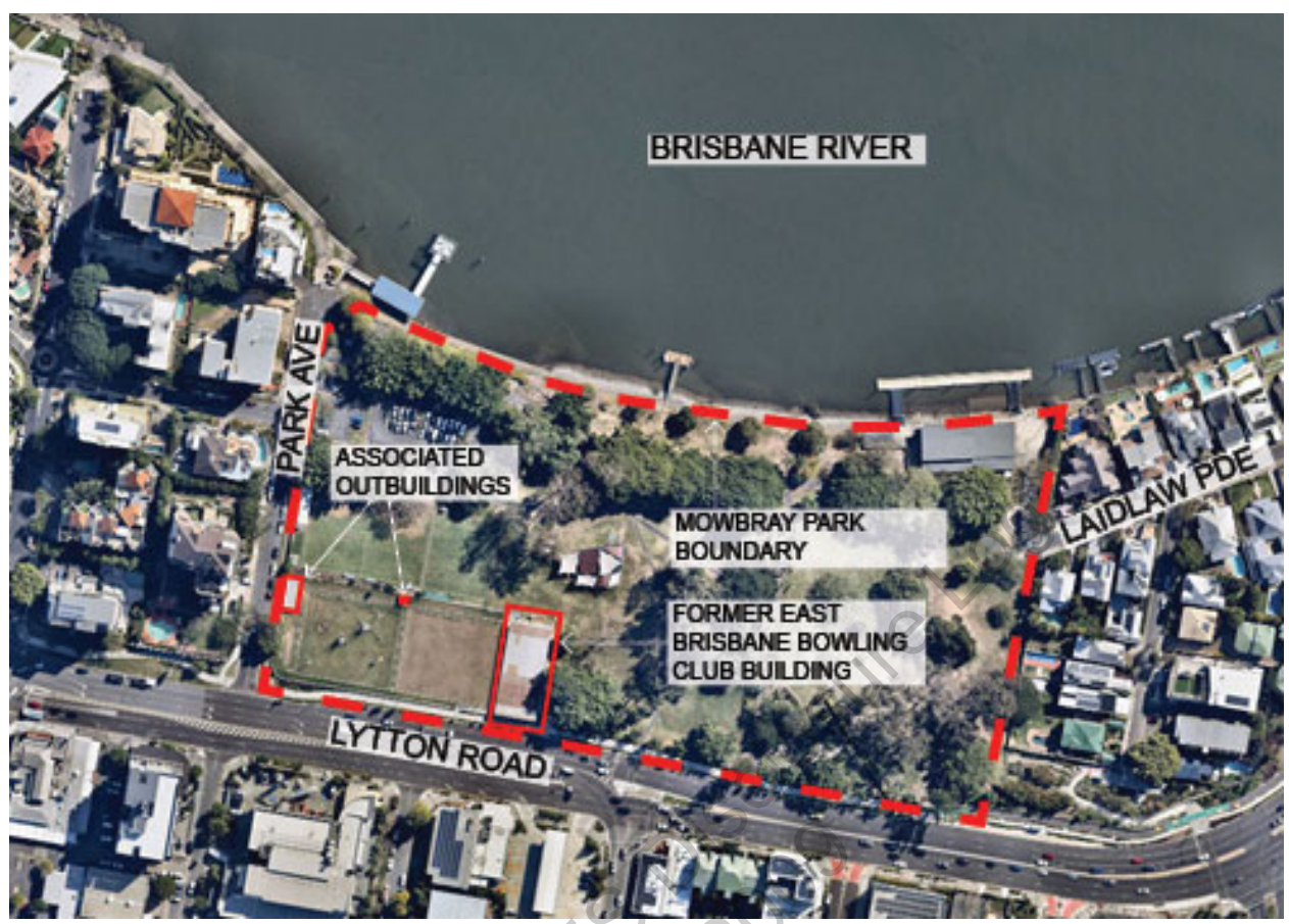
Figure 1 Location Plan.