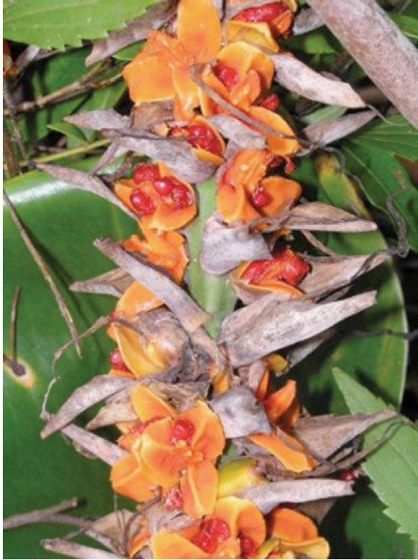
Figure 2. Mature seeds (red) being released from inside their orange capsules.