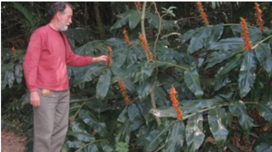
Figure 1. H. gardnerianum at Mount Glorious, near Brisbane.

H. coronarium —Pseudostems 1–3 m. Leaves sessile; ligule 2–3 cm, membranous; leaf blade oblong-lanceolate or lanceolate, 20–40 × 4.5–8 cm, adaxially glabrous, abaxially finely pubescent or thinly hairy, base acute, apex long acuminate. Spikes ellipsoid, 10–20 × 4–8 cm; bracts imbricate, ovate, 4.5–5 × 2.5–4 cm, 2- or 3-flowered. Flowers white, fragrant. Calyx ca. 4 cm, split on one side. Corolla tube ca. 8 cm, slender; lobes lanceolate, ca. 5 cm, central one spatulate, apex mucronate. Lateral staminodes oblong-lanceolate, ca. 5 cm. Labellum white, pale yellow at base, obcordate, 4–6 × 4–6 cm, apex 2-cleft. Filament ca. 3 cm; anther ca. 1.5 cm. Ovary sericeous. 2n = 34 (Shu 2000).