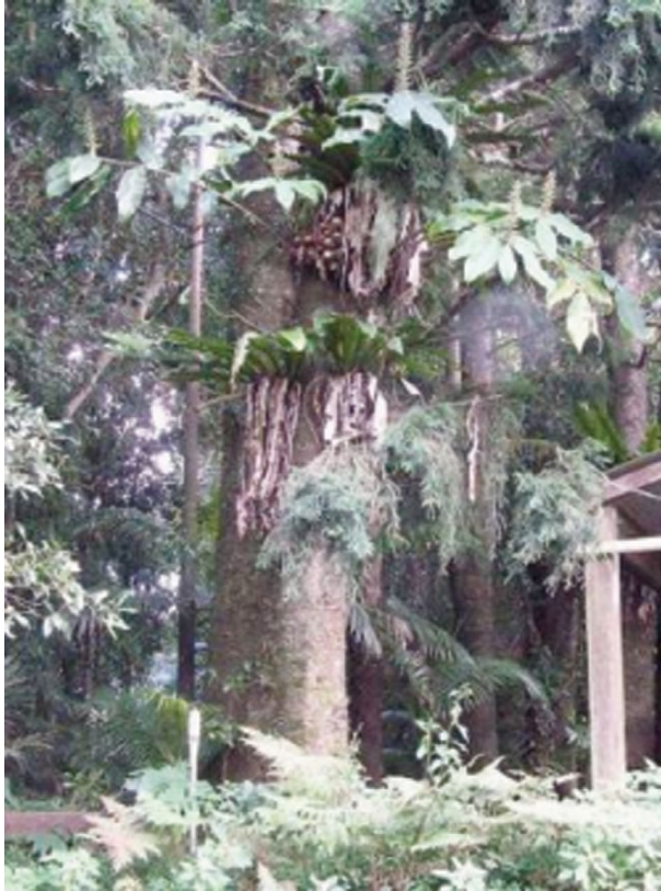
Figure 3. H. gardnerianum growing as an epiphyte in a hoop pine tree at Mount Glorious, Queensland.

The ecology of H. coronarium has not been studied in any detail. Like H. gardnerianum , H. coronarium appears to be shade-tolerant, as indicated by its growth in partial shade at Kamakou Preserve. However, it can also grow in exposed (full sun) sites. Seeds are produced at lower elevations in Hawaii, but seeds have lower dispersal potential compared to H. gardnerianum because they are not displayed to avian vectors (Smith pers. comm. 1985).