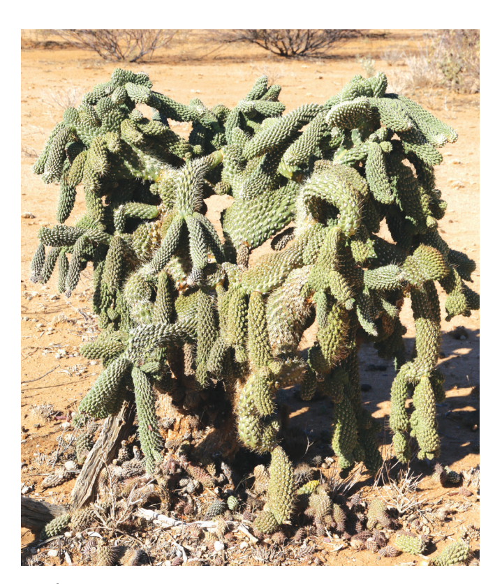
Coral cactus (Cylindropuntia fulgida var. mamillata)