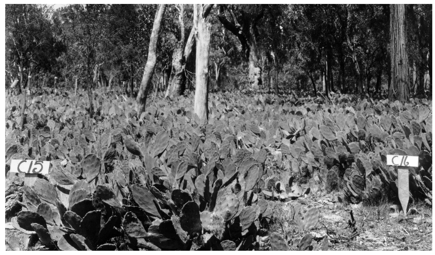
Property infestation before the release of cactoblastis