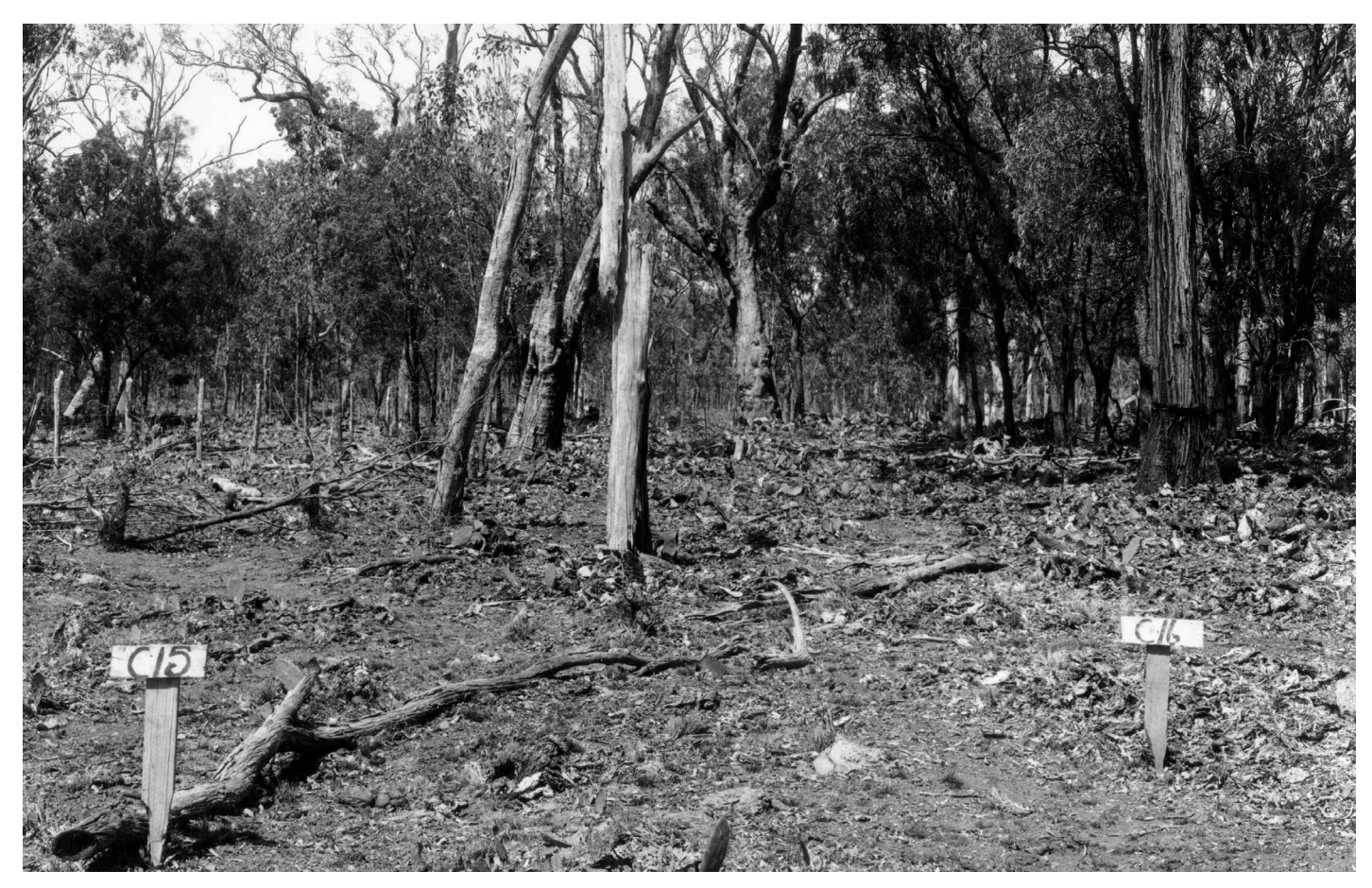
The same property following cactoblastis release