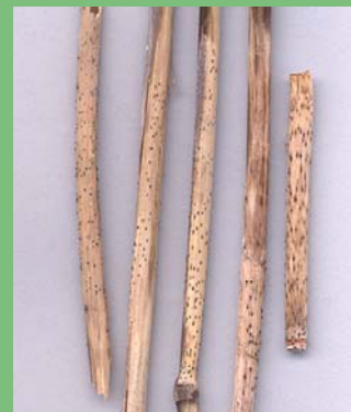
Black pseudothecia of Net blotch on stubble